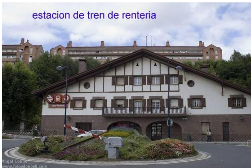
Train station of Lezo-Rentería

- Mind that you cannot arrive after the project starting date and departure earlier than project departure date!