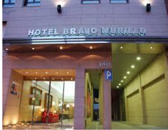
(Hotel main entrance)